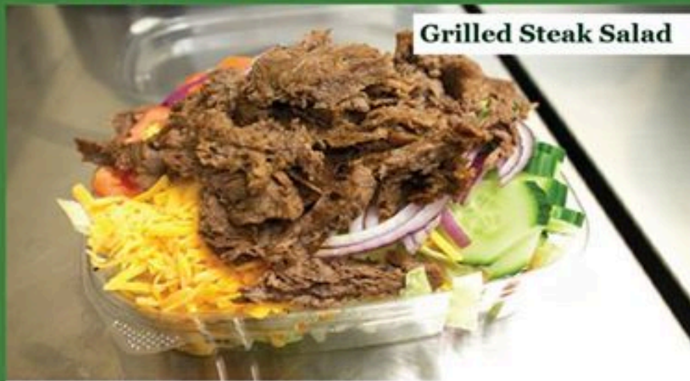
Grilled Steak Salad